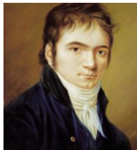
Ludwig van Beethoven.